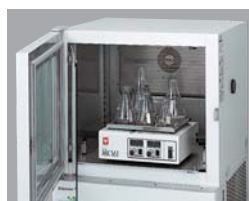
Incubator IN602CW slide shaker stage (optional) and MK161 installation example