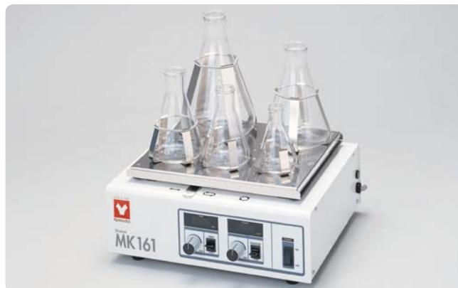
Example of using mounting stage and erlenmeyer flask holder clamps (optional)